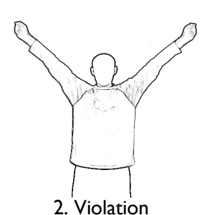
"Violation" Hands above head forming a V, closed fists