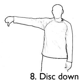
"Down" Thumb pointing straight downwards